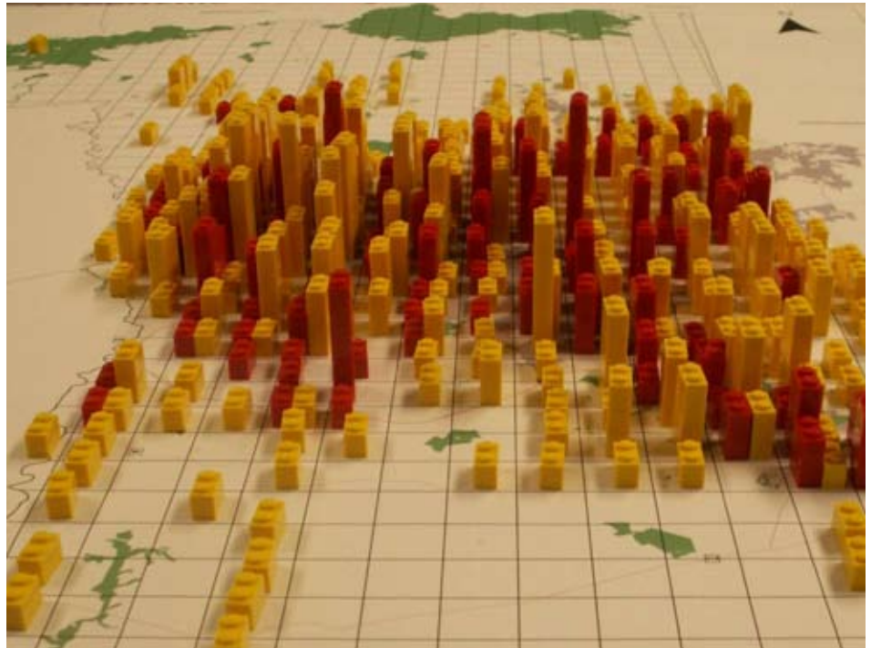
Participants in the “One County. One Future” workshop on November 11 will use maps and blocks to plot the future growth of Greenville County.

The resulting ideas will be reviewed upon completion and later analyzed by planning staff to provide input to the pending update to the county’s comprehensive plan. According to Long, there is one very fundamental objective to this process: “This is a means to find common ground for change within the